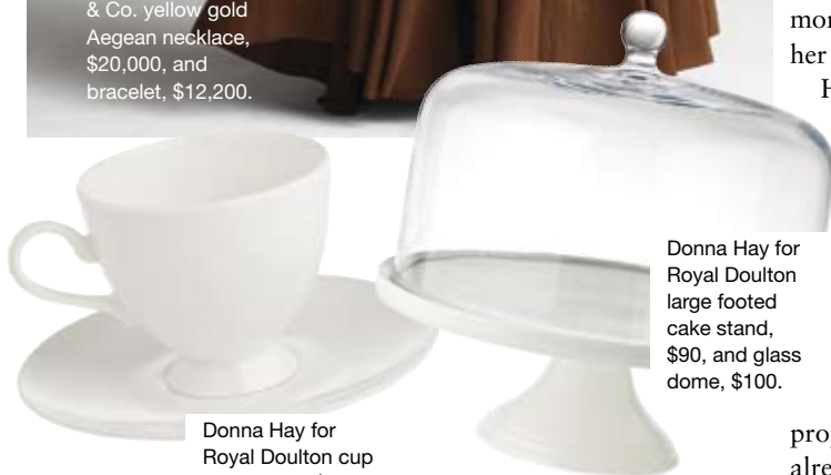
Donna Hay for Royal Doulton cup and saucer, $25.

"I like things to be beautiful but practical"