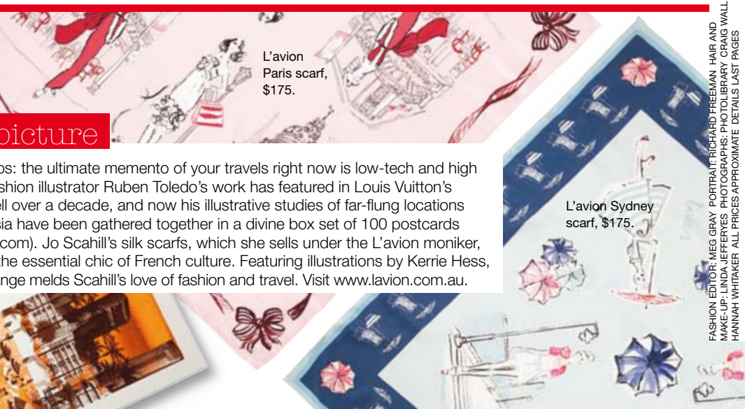
L'avion Paris scarf, $175.